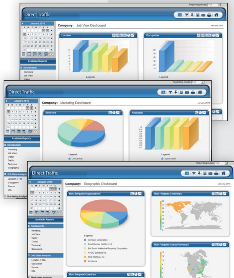
Figure 1. Direct Traffic Report

Want more information about how Direct Syndication can increase traffic to your career site? Call (866) 268-6206 today!